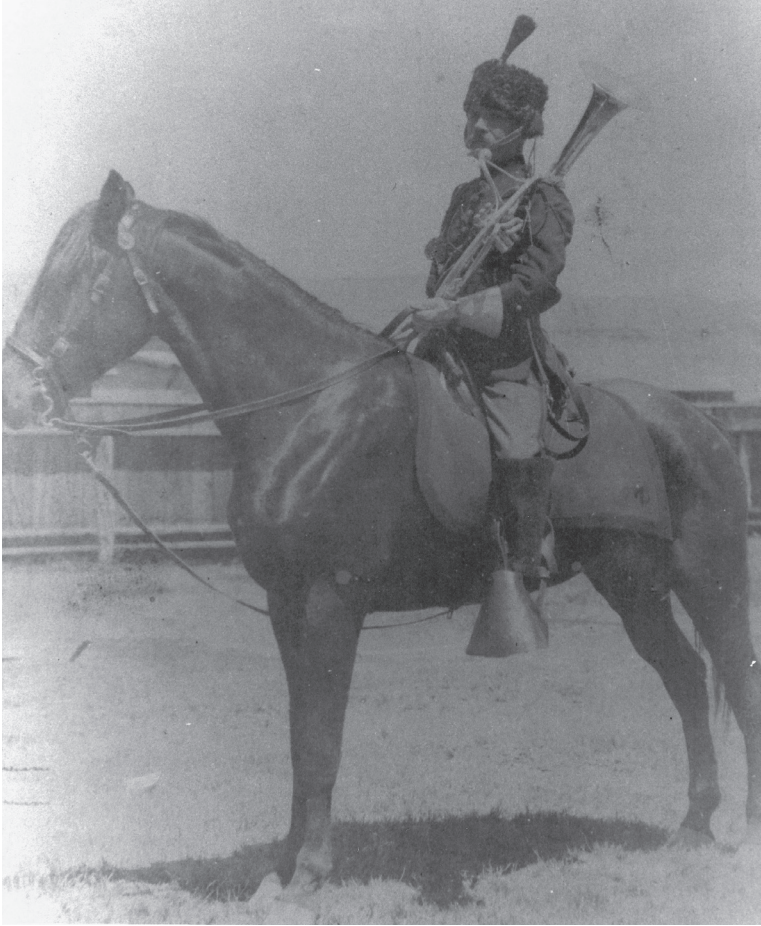
Figure 2: Tenor horn player of the 2nd Cavalry Band, Fort Wingate, New Mexico, ca. 1894. U.S. Army Military History Institute (Carlisle, Pennsylvania), RG 49S-L. Dunston. 2. Reprinted by permission.

bass drums and cymbals, along with snare and/or side drums in the dragoon tradition. 22 Kettledrums were rarely used in U.S. bands at this time.